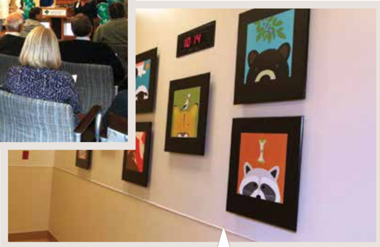
Child-friendly artwork lines the walls of the pediatric trauma bay.