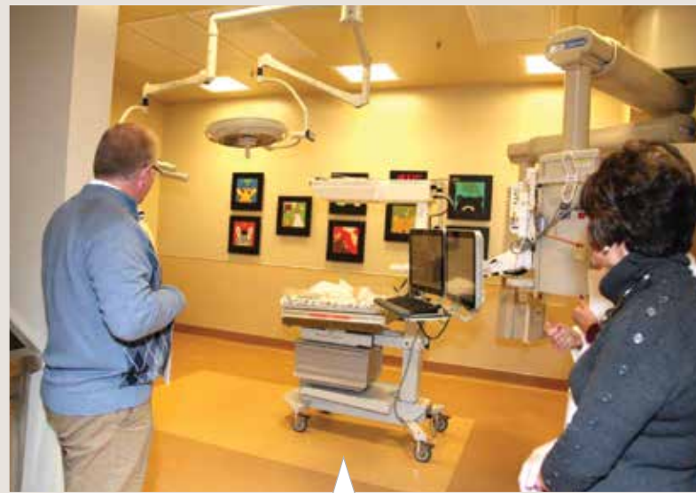
Employees get a preview of the pediatric trauma bay at the Open House event.