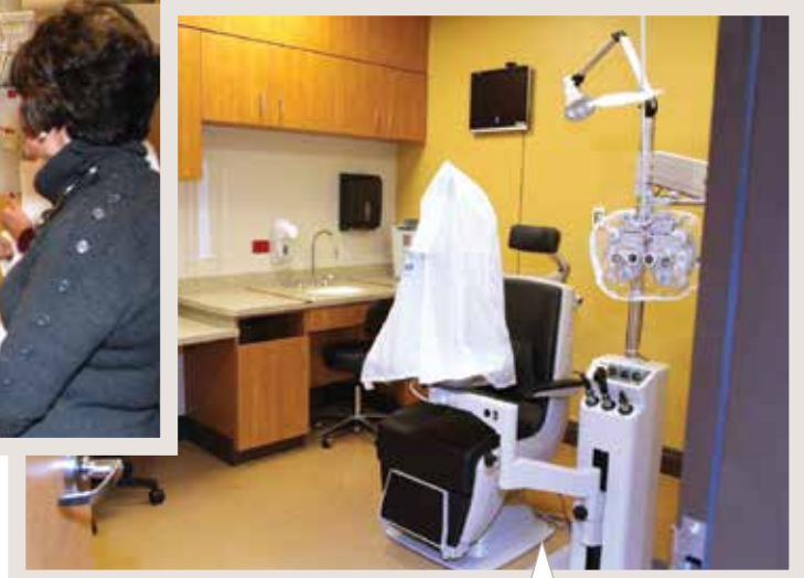
With the remodel, the ED gained an ophthalmology area with an eye exam room and special equipment.