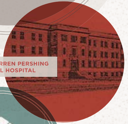
FRANCES WARREN PERSHING MEMORIAL HOSPITAL

MORE THAN $40 MILLION HAS BEEN RAISED FOR THE HOSPITAL SINCE THE FOUNDATION WAS ESTABLISHED IN 1977.