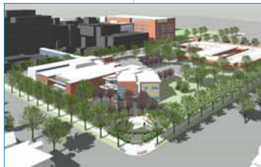
Artist rendering of the proposed Cancer Center

treatment and support all in one location. The Center will accommodate a patient's entire team of caregivers who can meet and decide treatment