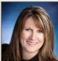
Carmalee Rose Chair