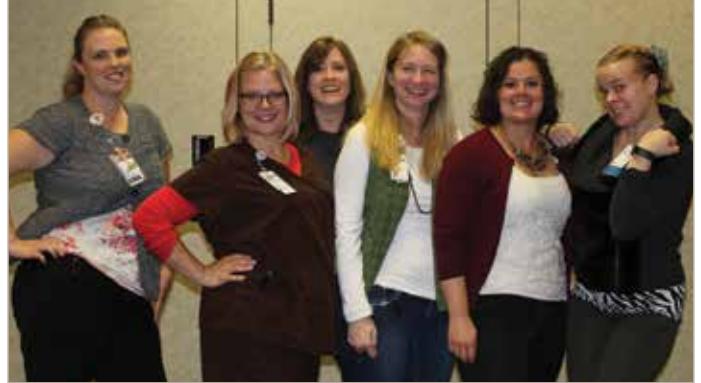
Members of the Employee Advisory Board show off their FitBits.

We invite you to purchase a FitBit or another activity tracker and count your steps along with us! Once set up, it's easy to use. Besides counting